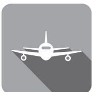
Defense & Aerospace