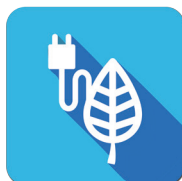
Energy & Environment