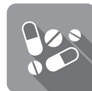
Healthcare & Bio-Sciences